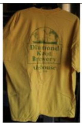
DIAMOND KNOT FRONT AND BACK - XL