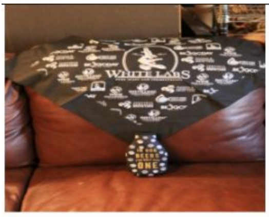
WHITE LABS DOG BANDANA

IN DOG YEARS I'VE ONLY HAD ONE BEER KOOZIE