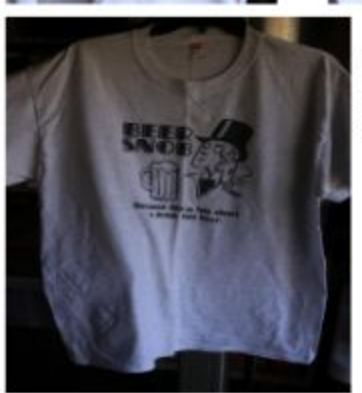
BEER SNOB BECAUSE LIFE IS TOO SHORT TO DRINK BAD BEER - L