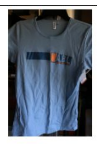
LADIES WABL - L