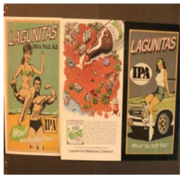
SET OF 3 LAGUNITAS POSTERS