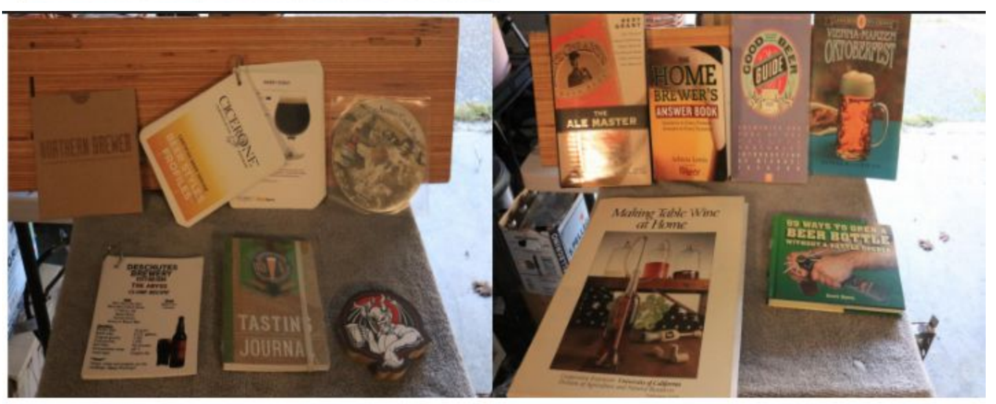
BREW AND JUDGE YOUR BEER IN ONE BUNDLE! CICERONE BEER STYLES PROFILES, ASSORTED RECIPES, AND TASTING JOURNAL

THE ALE MASTER – BERT GRANT HOME BREWER'S ANSWER BOOK GOOD BEER GUIDE VIENNA MARZEN OKTOBERFEST STYLE BOOK MAKING TABLE WINE AT HOME 99 WAYS TO OPEN A BEER BOTTLE WITHOUT AN OPENER