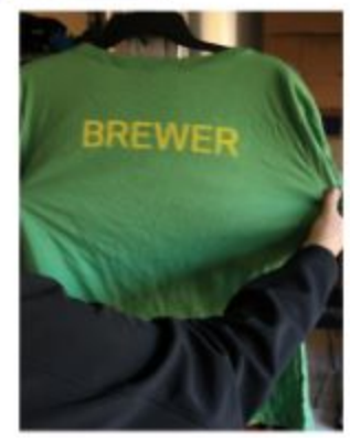
PICO BREW FRONT AND BACK - XL