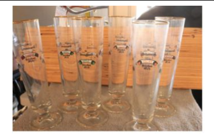
SET OF 6 GOLD RIMMED LINDEMAN'S GLASSES