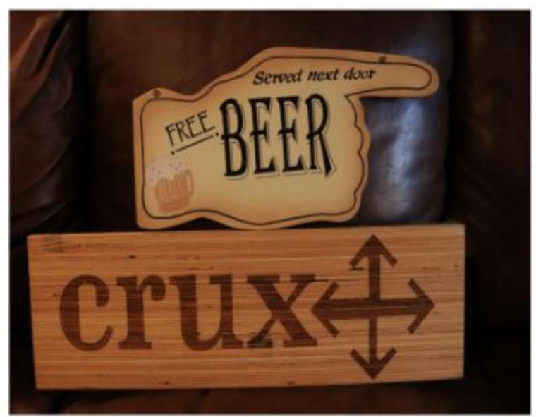
FREE BEER SERVED NEXT DOOR