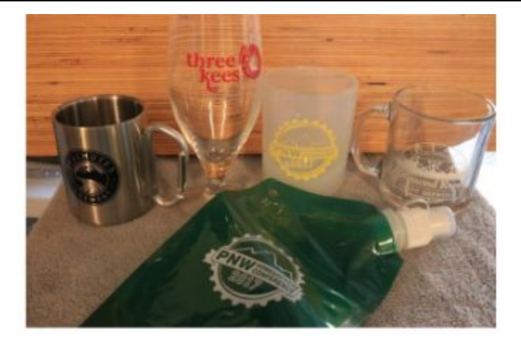
MISCELLANEOUS GLASSWARE, ETC.

DESCHUTES METAL CUP WITH CARABINER THREE KEES CIDER GLASS PNW PLASTIC GLASS DIAMOND KNOT GLASS (5) PNW CONF GREEN PLASTIC