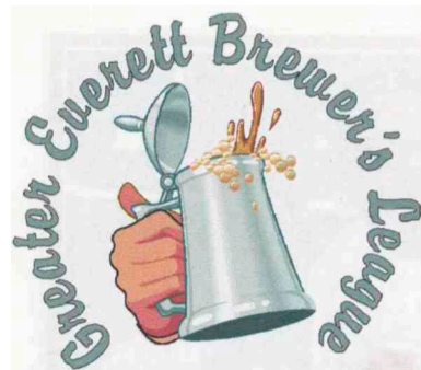
1998 GEBL Logo