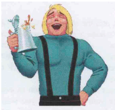
1996 GEBL Logo

I encourage everyone to check out the Newsletter archives on our website www.gebl.org for way more history than I could possibly summarize in a short article.