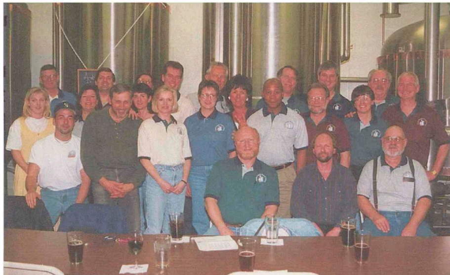
1998 Scuttlebutt gathering (from April 1998 newsletter)