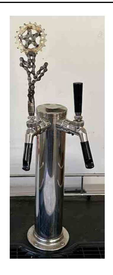
Getting Ready for Fresh Hops Competition